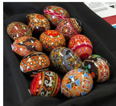
Ukrainian Pysanky Egg Class