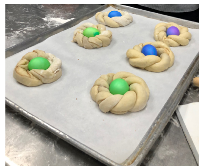
Easter Pie Class