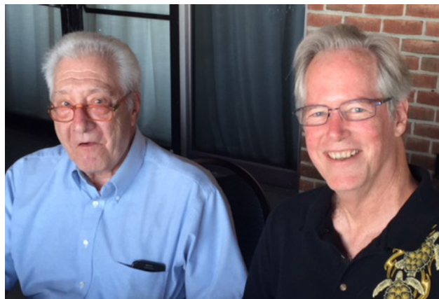
Father and son members enjoy the Annapolis Lodge's anniversary dinner celebration at Pussers on the water!